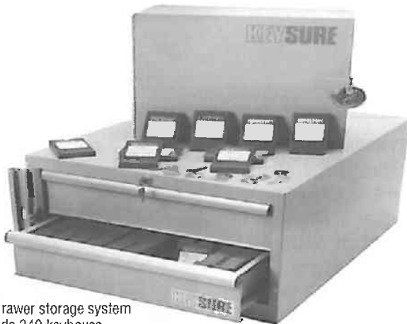
2 drawer storage system holds 340 keyboxes 22.25"W x 28.50"D x 15.75"H