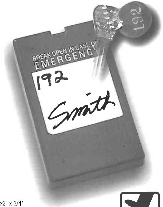
101-B 4 3/4" x3" x 3/4"

Also available as part of a key control system. See the cabinets below. Drawer configurations also available, call for details.